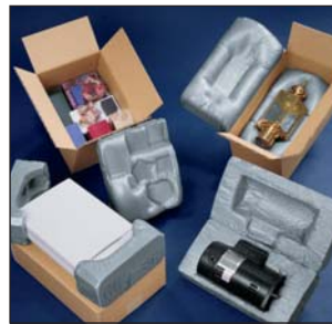
Instapak® Foam Packaging