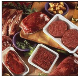
Cryovac® Food Packaging