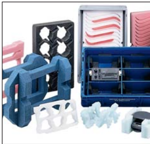
CelluPlank® Polyethylene Foam Stratocell® Laminated Foam