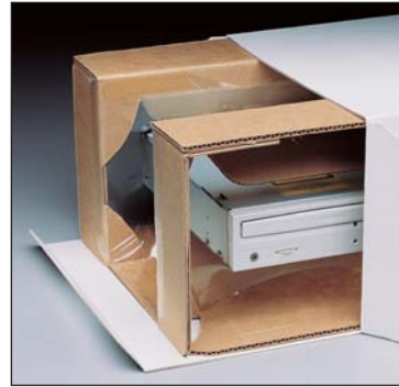
The flexible film membrane stretches to hold unusual shapes and provides excellent product visibility.

provides high value or fragile products with unparalleled product protection throughout the shipping cycle – even after repeated drops. The tough and resilient suspension film retains its effectiveness for multiple use – including return shipments.