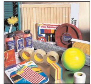
Cryovac® Performance Shrink Films