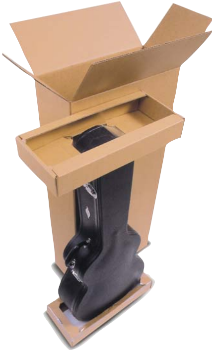
Korrvu® suspension packaging protects even the most fragile items from the rigors of the distribution environment.