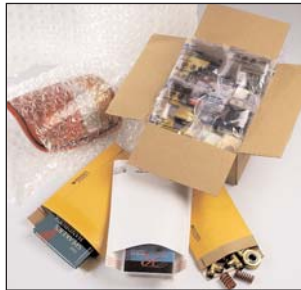
Bubble Wrap®, Jiffy® and Fill-Air™ Materials, Mailers & Systems