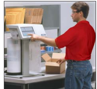
Instapacker™ Tabletop Foam-in-Bag Packaging System