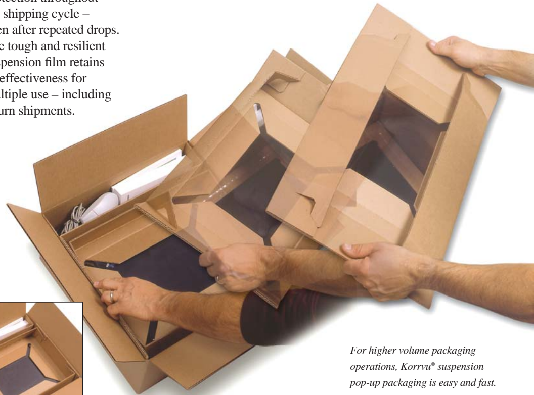
For higher volume packaging operations, Korrvu® suspension pop-up packaging is easy and fast.

Korrvu® suspension packaging is easy to use and simple to assemble. No extensive operator training is required.