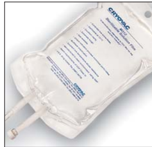
Cryovac® Medical Films